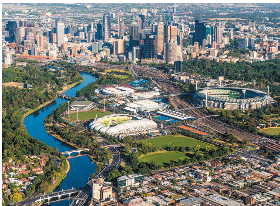
Equipping cities to weather our changing climate takes many disciplines working together.